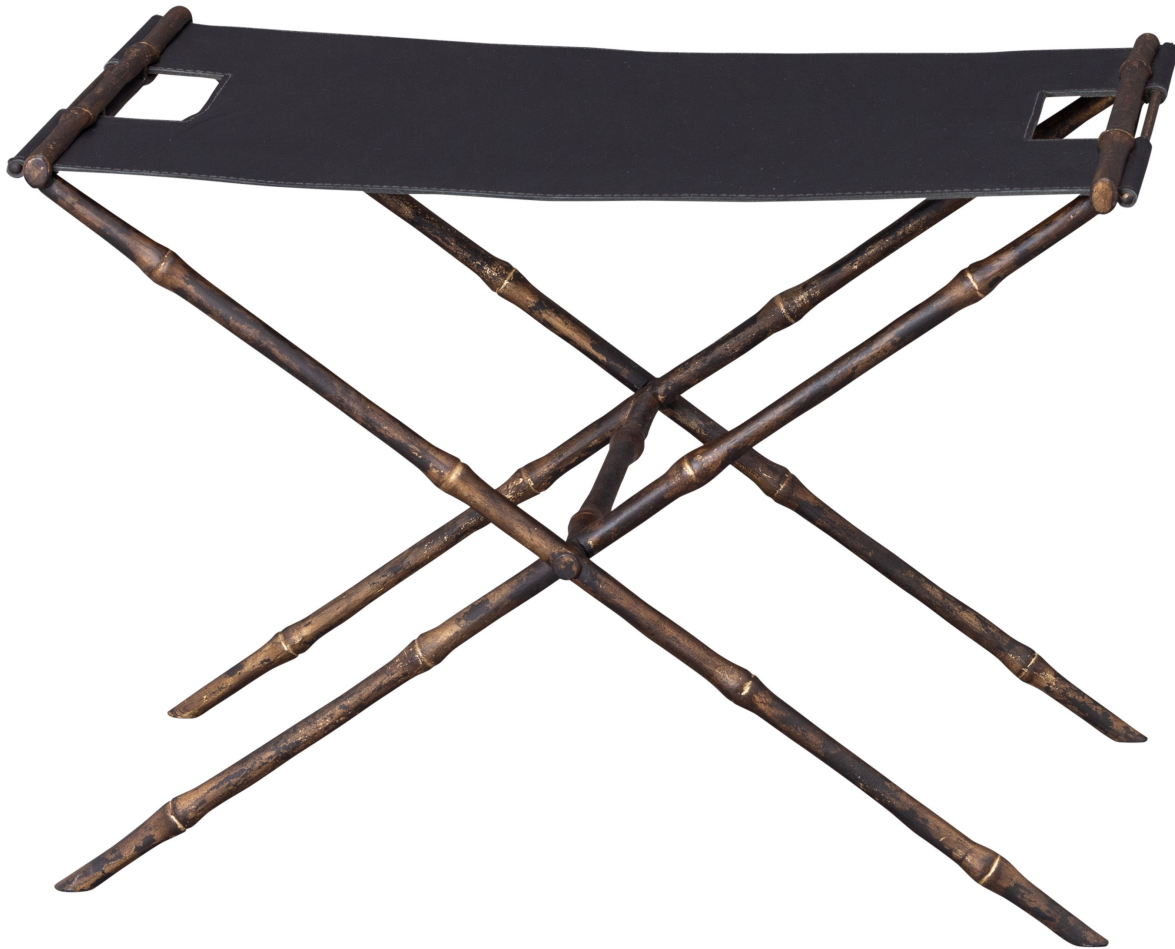
BOUDIN FOLDING BENCH