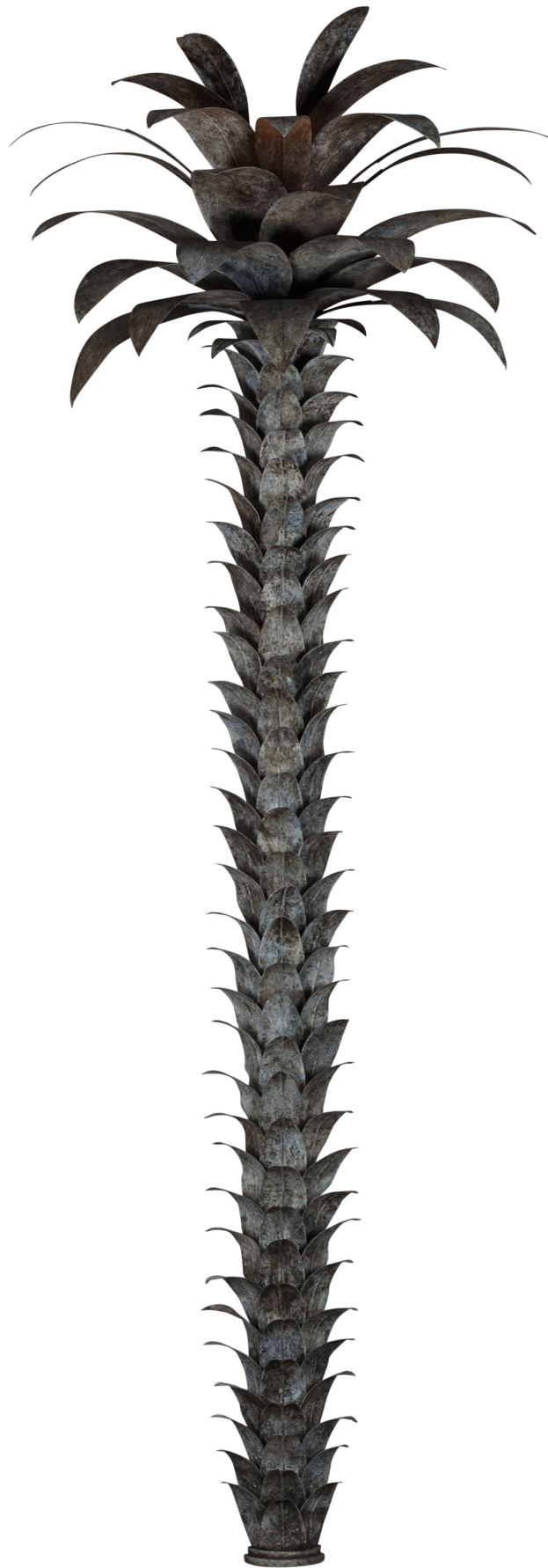
PALM TREE TORCHIERE